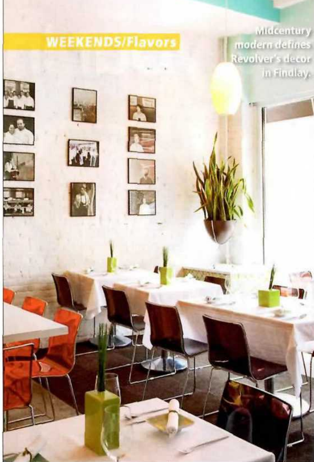
Midcentury modern defines Revolver's decor in Findlay.